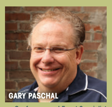
Conference and Event Specialist