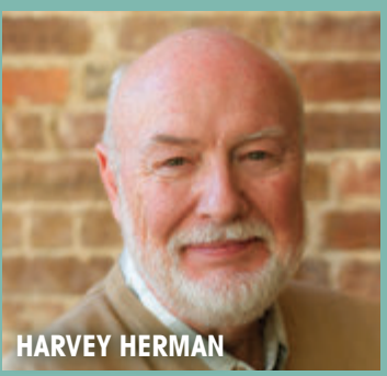
Program Director Supervises the core ministry teams that encompass the National Chi Alpha Program.