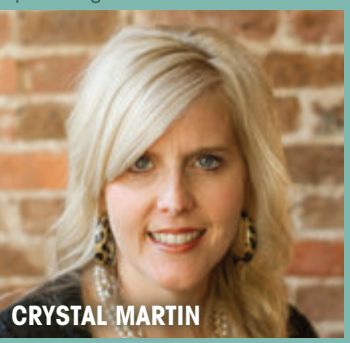
XAI Director Is the ambassador for international student ministry to Chi Alpha staff, students and the church at large.