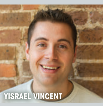
Department Finance Specialist