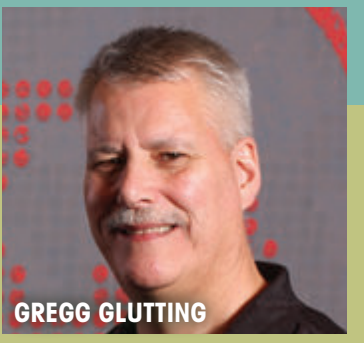
Support Raising Specialist