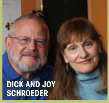
Leadership Development Specialists