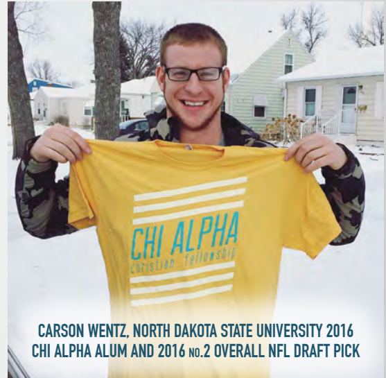
CARSON WENTZ, NORTH DAKOTA STATE UNIVERSITY 2016 CHI ALPHA ALUM AND 2016 NO.2 OVERALL NFL DRAFT PICK

When I met Carson, he already had a solid relationship with Jesus. His Christian teammates had helped him realize there was more to life than football. Over the next couple of years, we met together regularly to talk, read the Bible, and pray. Oh, and eat. We did a lot of eating.