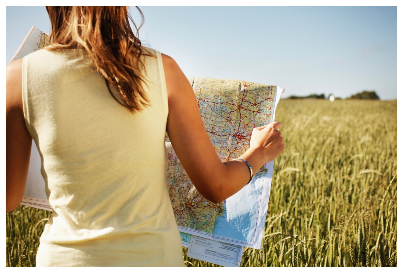
Week 9: Map