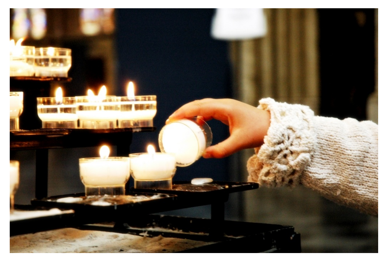
Week 5: Temple