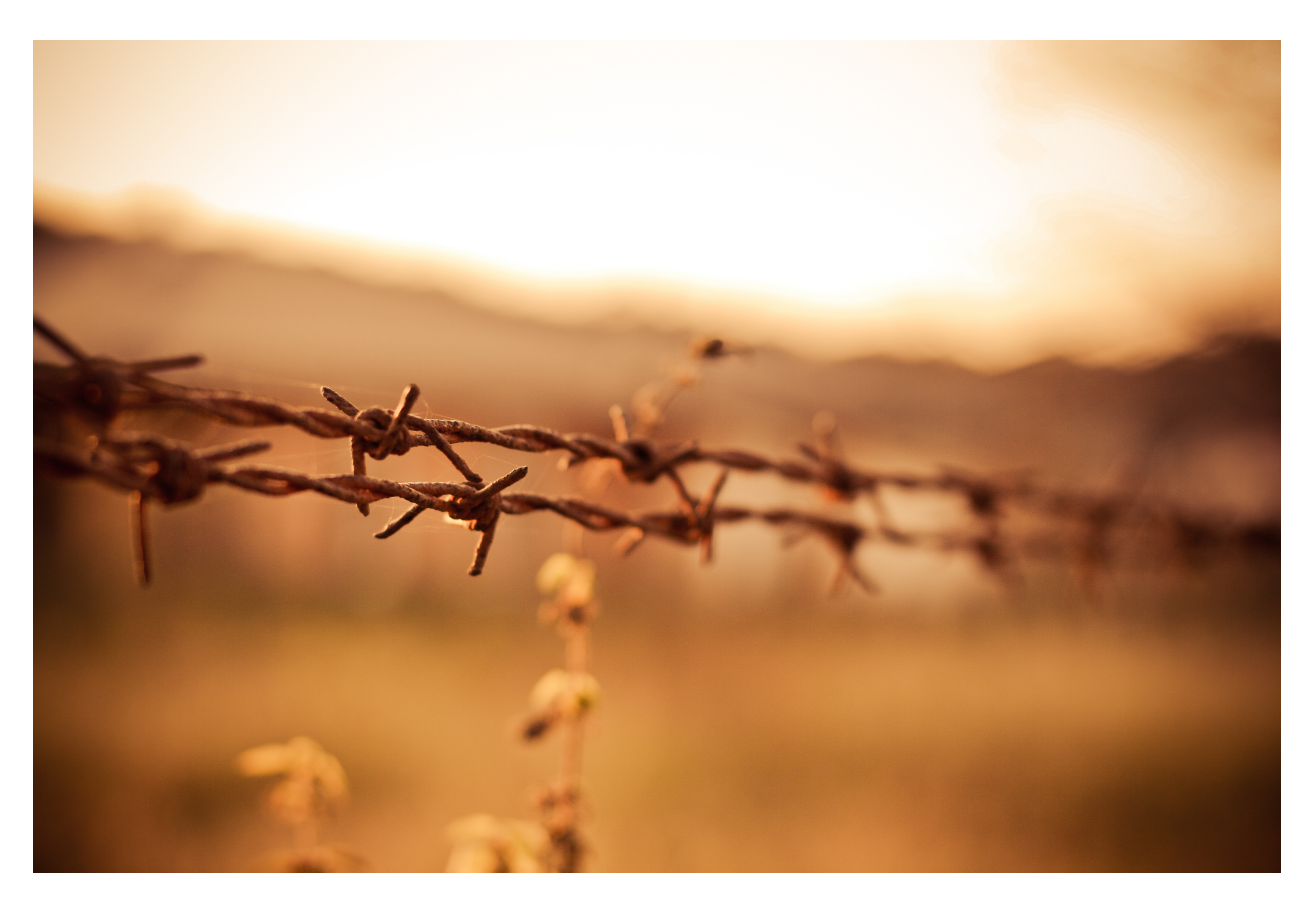
Week 2: Thorns