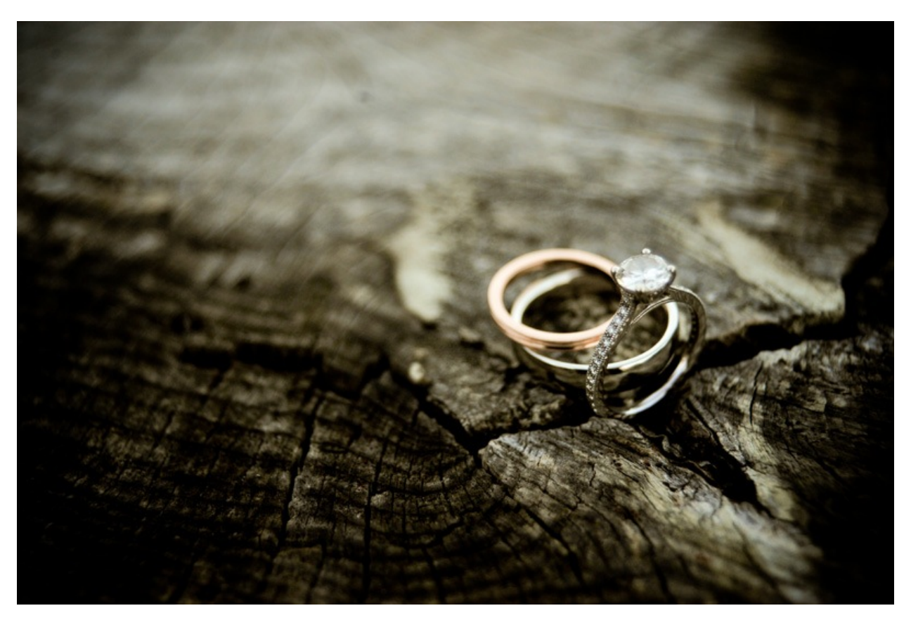
Week 4: Covenant