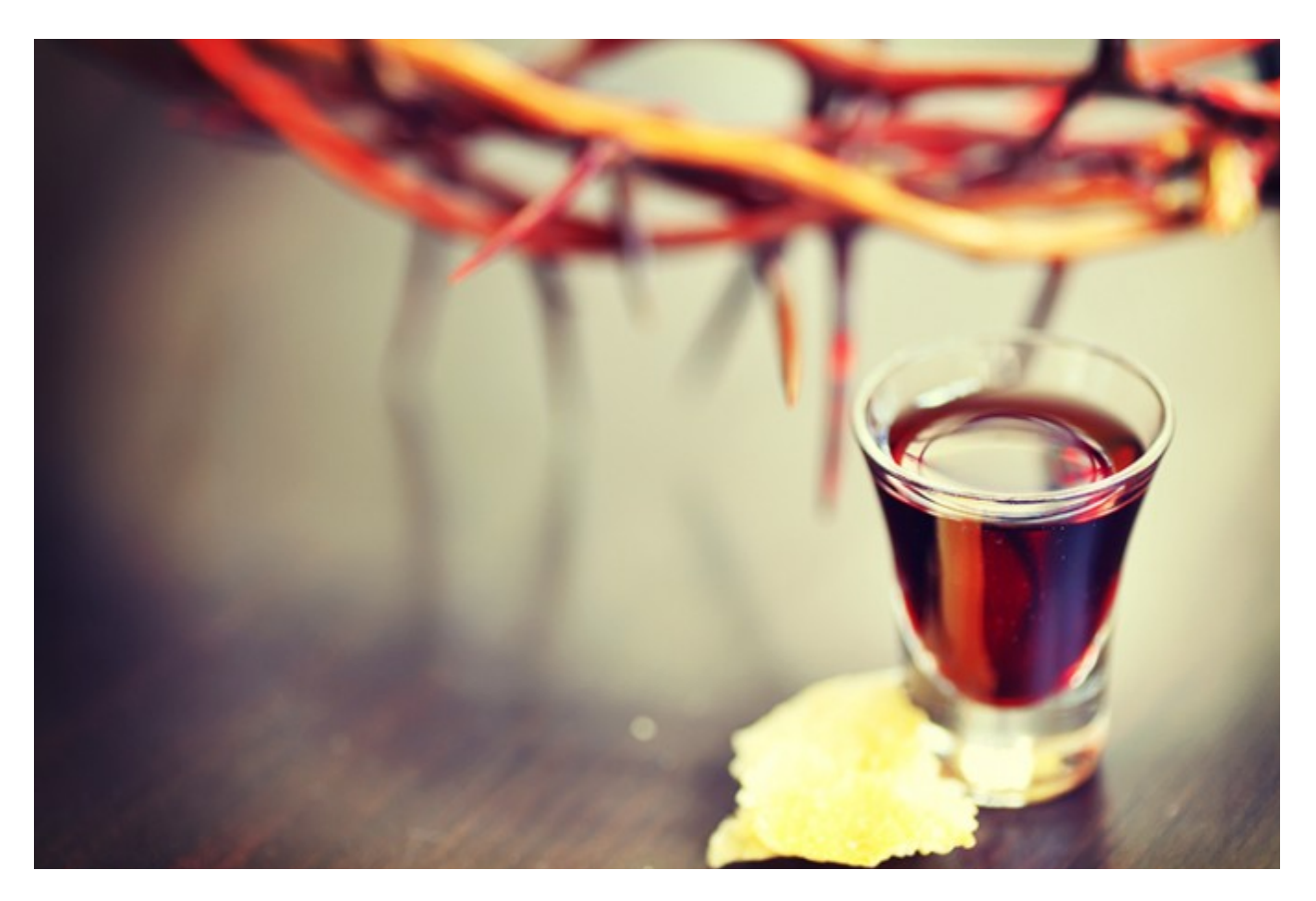
Week 8: Communion