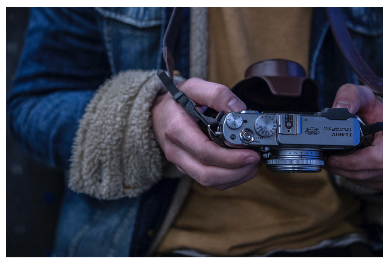
Week 1: Image