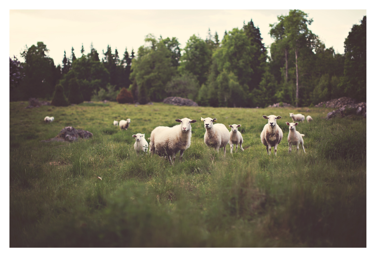
Week 3: Lamb