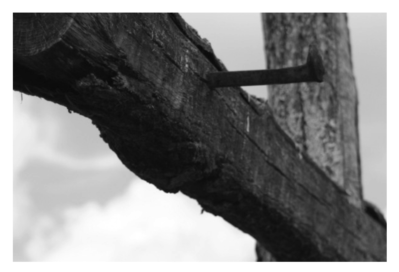
Week 7: Cross