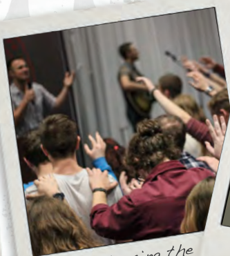
Experiencing the Holy Spirit

Bustling students clogged the walkways of the George R. Brown Convention Center in Houston as they hurried to experience different countries, get in touch with ministries around the globe, and learn how God can use their talents to preach the gospel. Lines snaked down the halls as they awaited their turn in the next rotation. Once they entered, they were never the same.