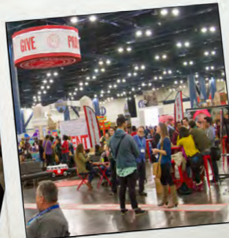
Chi Alpha exhibit booth

The most moving moments of the exhibit were face to face conversations with the missionaries who had traveled from all over the world to meet and pray with the students in the exhibits. So much was asked and so much was learned. Countless stories of God ordained encounters defined the hours when the exhibits were open. In many instances, bonds formed naturally and connections were made to serve with a missionary, and in many others, students signed up to learn more about existing opportunities to serve.