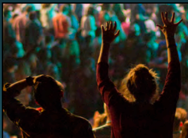
Two attendees worship as fellow students answer to the call to give a year and pray about a lifetime

He said, "No, that's not what I want. I know this is unprofessional of me, but I can't do my work anymore. You see, I've been away from the Lord for about ten years, but His presence is so overwhelming that I had to talk with you. Will you pray for me?" That morning he rededicated his life to the Lord! That only happens when the presence of the Lord is overpowering. At the Summit gatherings, it definitely was.