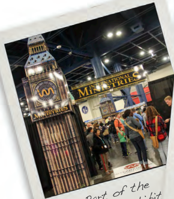
Part of the AGWM exhibit

As you entered, you could not escape a sense that you had, truly, crossed a border. Inside the exhibits were impressive portrayals of daily life around the globe, with elaborate decorations and authentic displays that brought these immersive cultural experiences to life. In Latin America Caribbean, a full size tin shack was nestled beside a vibrant fruit market, where an electrical post leaned, it's wires reaching overhead to a favela with iron bars over the windows. A fifteen-foot waterfall splashed near the trees and a canoe sat for a photo op by a realistic backdrop of the Amazon River. As your coffee was served in traditional Costa Rican cloth pour overs, you might catch the rhythm of African drums on the wind, beckoning from the neighboring exhibit. In Asia Pacific, Chi Alpha students sat in circles on bamboo mats and experienced a typical moment in outreach to university students around the region. In Europe, a fence guarded a beach where a torn life raft had washed ashore, beside life jackets and clothing and small toys of those who had lost their lives fleeing war.