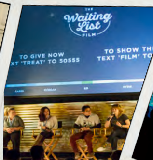
The Waiting List Film