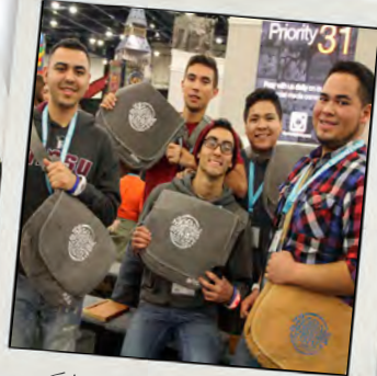
Students with their TWMS4 messenger bags