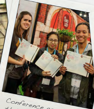
Conference goers loved their TWMS4 journals