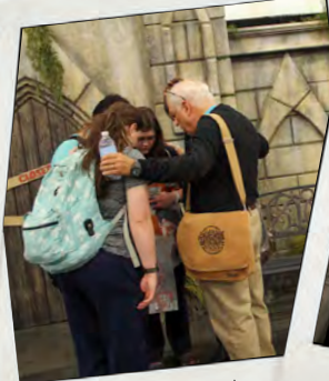
Praying together in an exhibit