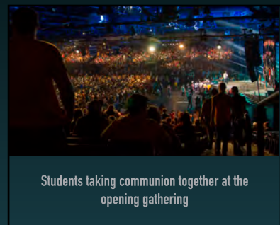
Students taking communion together at the opening gathering

The last night, I coordinated a lot of the moving pieces of the Summit and was the concluding gathering's speaker. As a result, I was backstage with the production team the morning of the last day. I told the team I would be back later that night to go over my message and get the sound check. I walked back out into the arena and was followed by one of the audio-video team members. He stopped me and asked if I would speak with him. Thinking he wanted to discuss my message and the sound check, I immediately said I would be back later that afternoon.