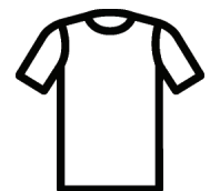
T - SHIRT