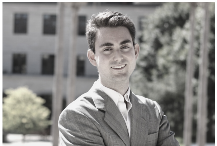
Greyscale intensity: 40